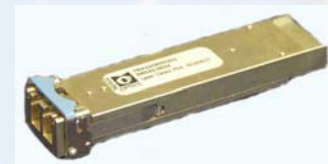
XFP (75 x 18 x 9)