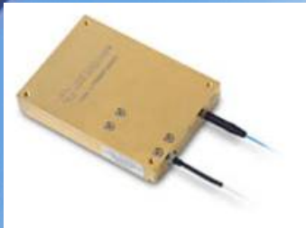
300-pin MSA (76 x 56 x 14)