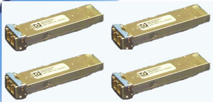
4 x XFP