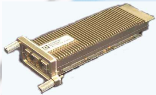
1 x XENPAK@40Gb/s