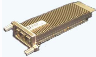
XENPAK (121 x 36 x 12)