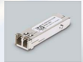
SFP+ (45 x 13.5 x 8.5)

(Dimensions are indicated as L x W x H in mm )