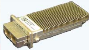
X2/XPAK (~76 x 36 x 12/11)